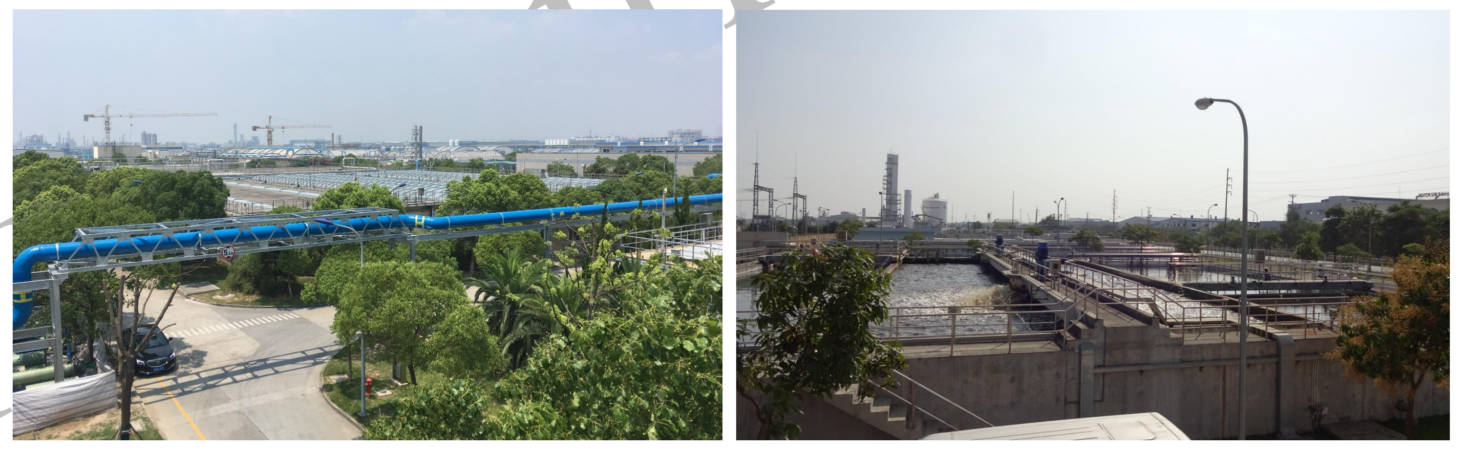
Figure 2: Visit of different central wastewater treatment plants of industrial parks in China

in Germany, China and Vietnam. The idea behind was to learn from the existing industrial parks for new ones, which are the focus of this approach.